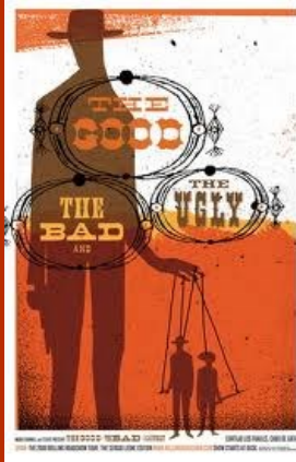
Good, Bad and Ugly movie poster