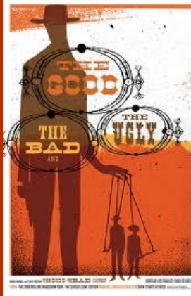
Good, Bad and Ugly movie poster

With 70% of the league bowling above average, there wasn't much to choose for the Good, Bad and Ugly award. Only 11 bowlers had the numbers for the award.